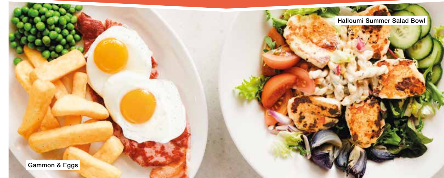
Gammon & Eggs