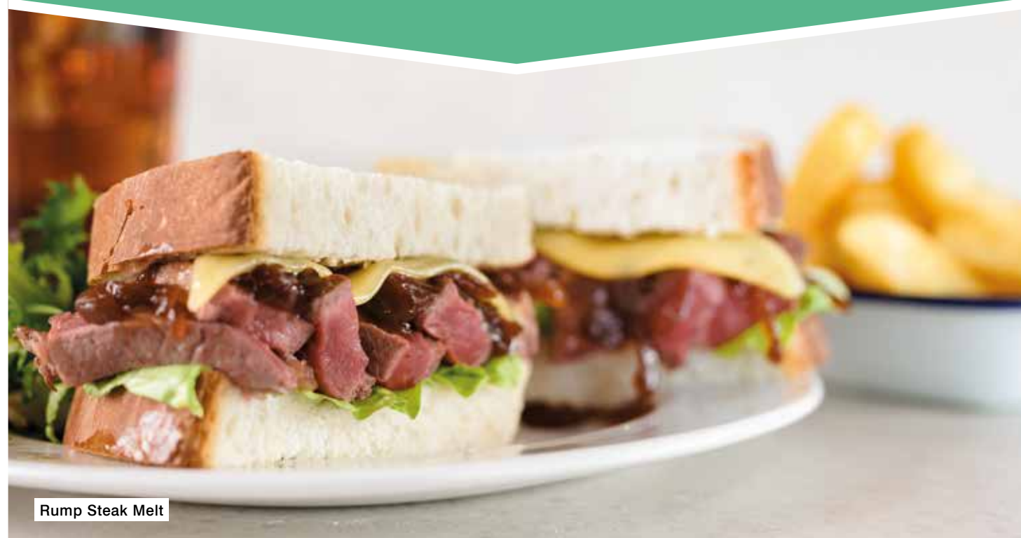
Rump Steak Melt