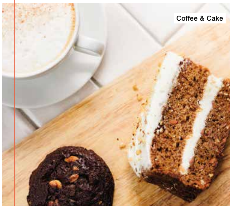
Coffee & Cake

Choose from a selection of tea or coffee and cake. Ask a team member for details.