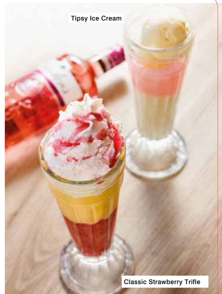
Topsy Ice Cream